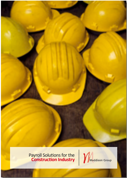
CIS (Construction Industry)